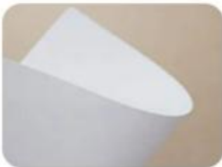
White Kraft Paper