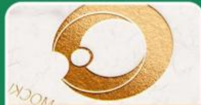
Gold Foil Stamp