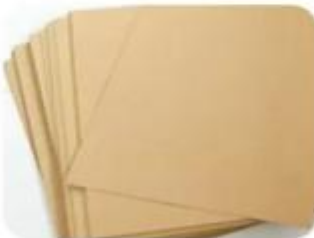
Brown Kraft Paper